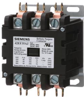
Contactor, 42DP,60A,3P,Open,120 Contactor, 42DP,60A,3P,Open,120