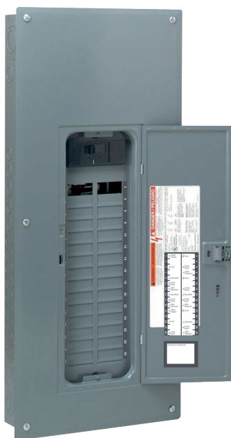
Homeline™ Load Center 30-space indoor