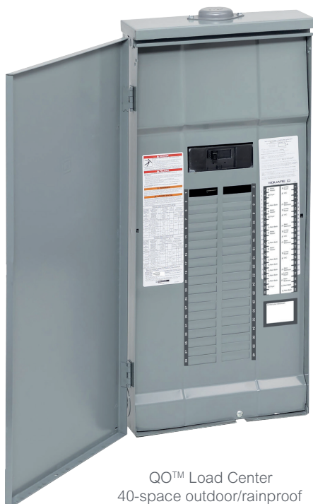
QO™ Load Center 40-space outdoor/rainproof