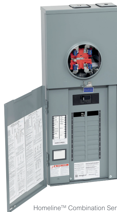
Homeline™ Combination Service Entrance Device (CSED) 20-space All-in-One

A wide variety of circuit names to choose from!