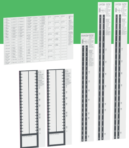
UCD42CP Universal Circuit Directory Kit