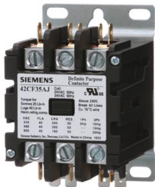
Contactor, 42DP,40A,3P,Open,120 Contactor, 42DP,40A,3P,Open,120