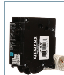
1-Pole Branch Feeder AFCI