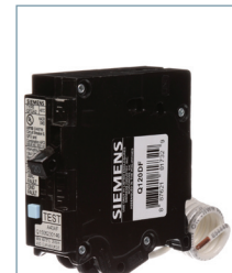
1-Pole Dual Function AFCI/GFCI