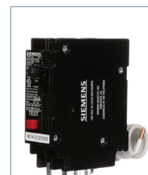
1-Pole Equipment Protection