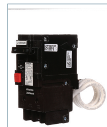
2-Pole Equipment Protection