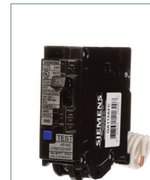
1-Pole Combination Type AFCI