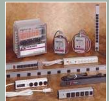
Power & Data Quality