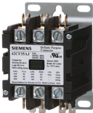
Contactor, 42DP,40A,3P,Open,480 Contactor, 42DP,40A,3P,Open,480