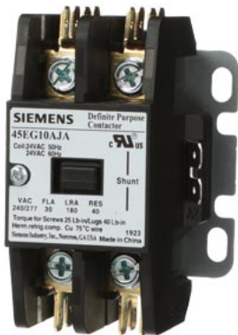
Contactor, 45DP,30A,1P,Open,480 Contactor, 45DP,30A,1P,Open,480