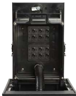
2-gang low voltage box (shown with communications options)