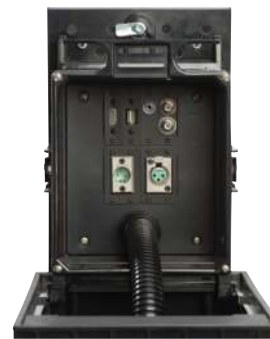
2-gang low voltage box (shown with audio/video devices)

Ground Boxes are also available with the following receptacles: