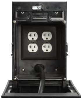
2-gang, 20 amp duplex receptacles (Available in single or two circuit versions)

The Outdoor Ground Box comes in three finishes to complement any outdoor space. It's available in a host of configurations to suit your needs.