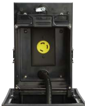
30 amp, 250V Turnlok® locking receptacle L6-30R