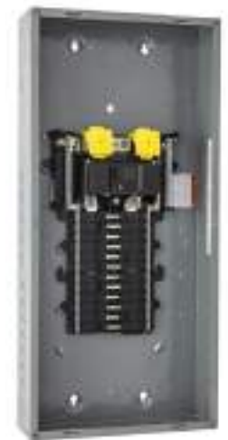
QO circuit breaker