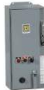
Pre-configured NEMA combination starter