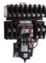
Open lighting contactor