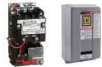
Open and enclosed NEMA non-combination starter