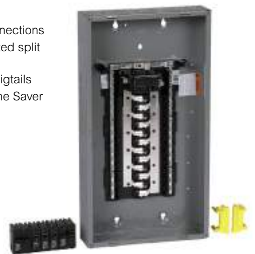
Homeline circuit breakers

Inspect load centers and circuit breakers